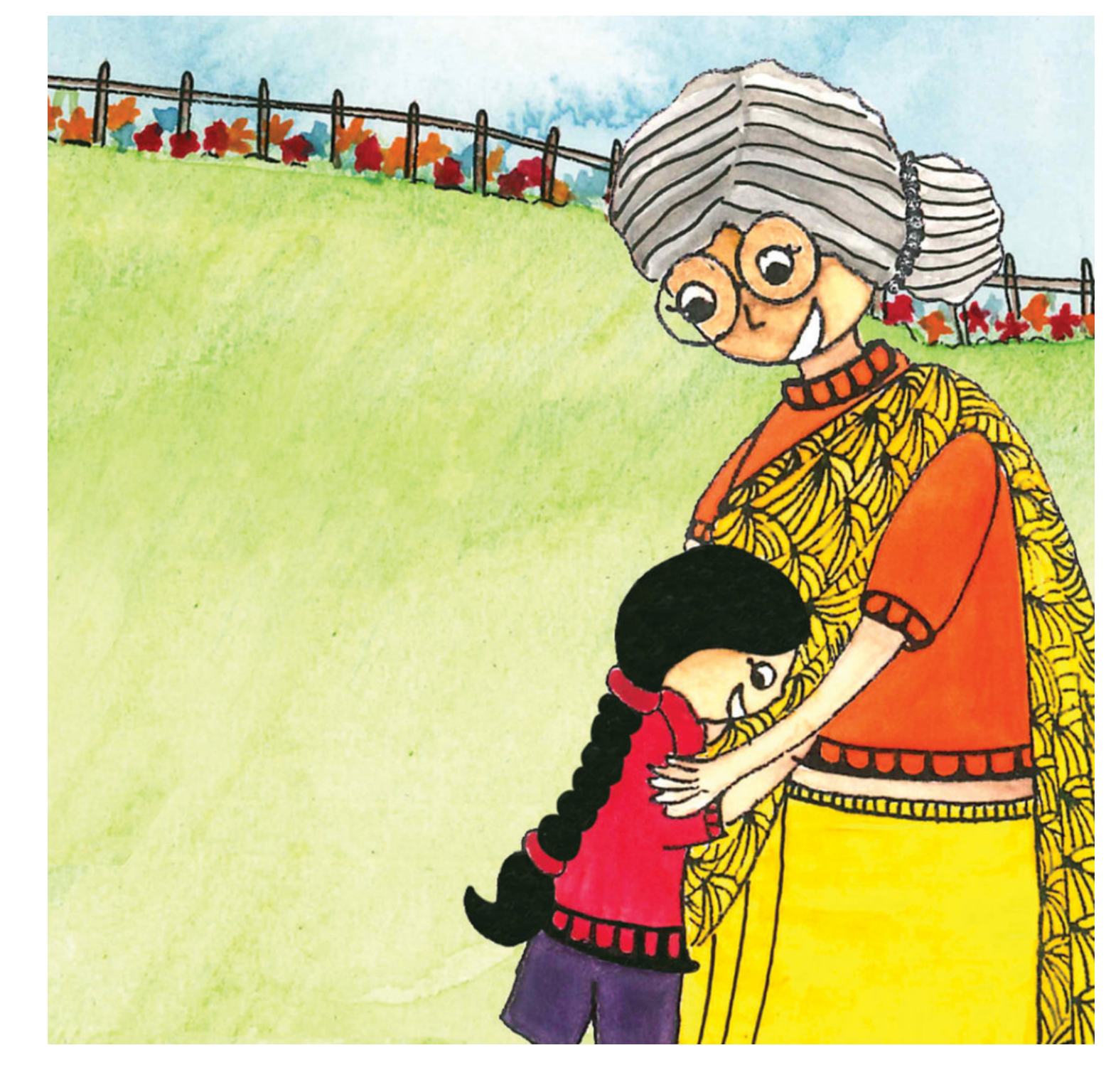
Ahora, tengo que bajar. Abuela me da un gran abrazo.