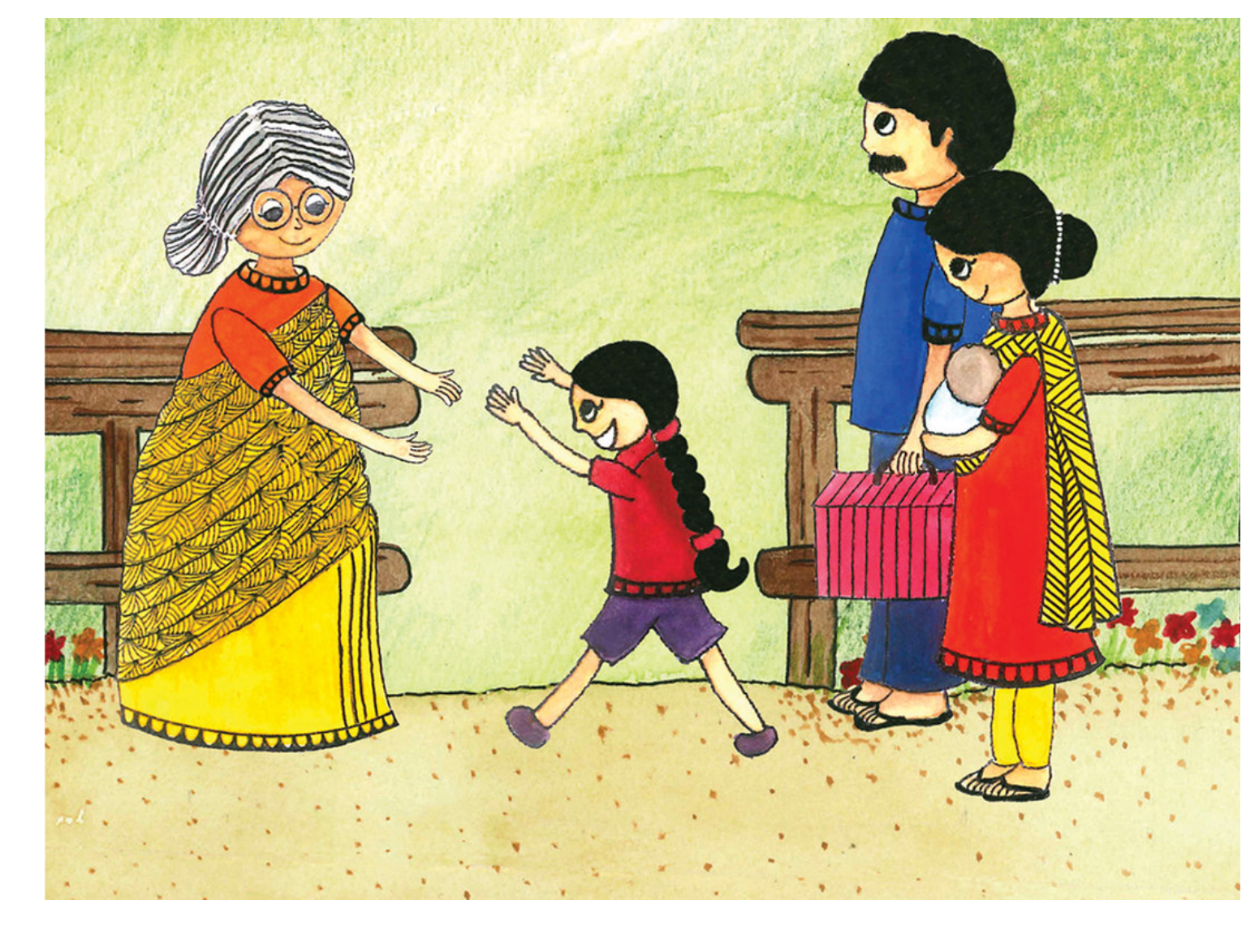
Nos gusta visitar el pueblo de Abuela.