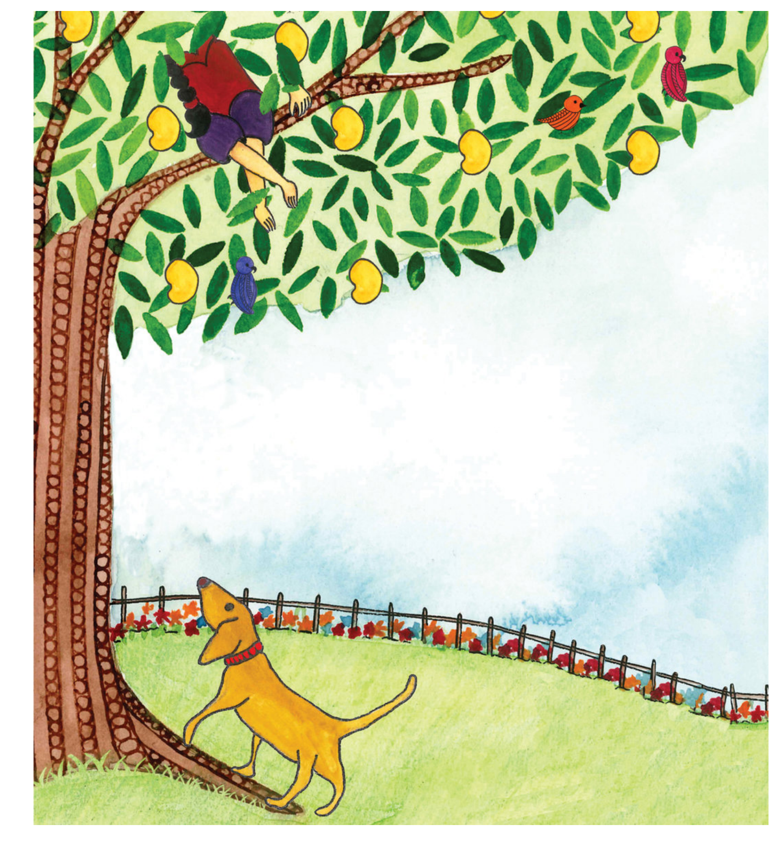
¡Oh no! Al fin, el perro de la abuela me encuentra.