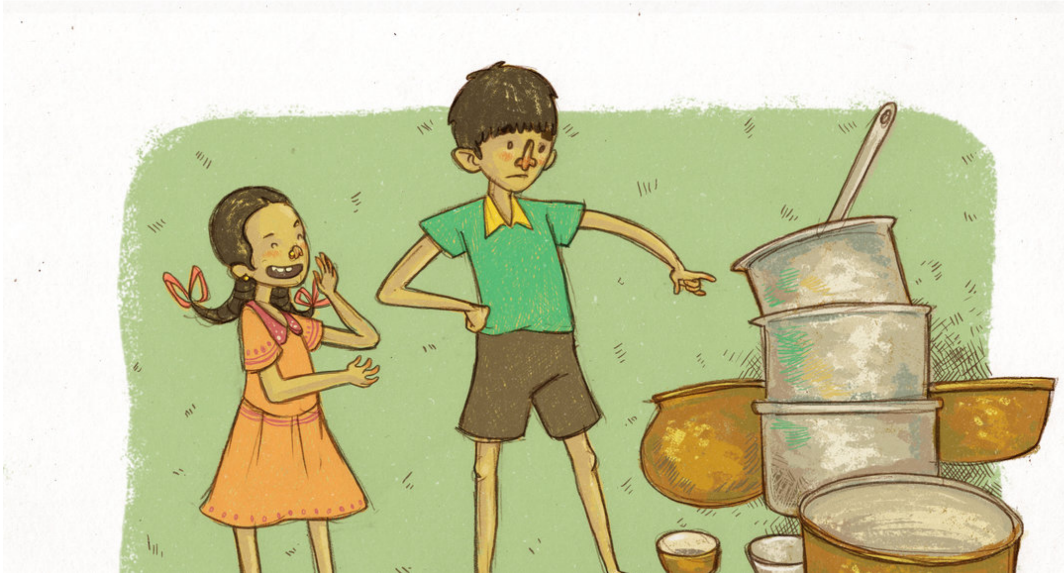
ollas y sartenes