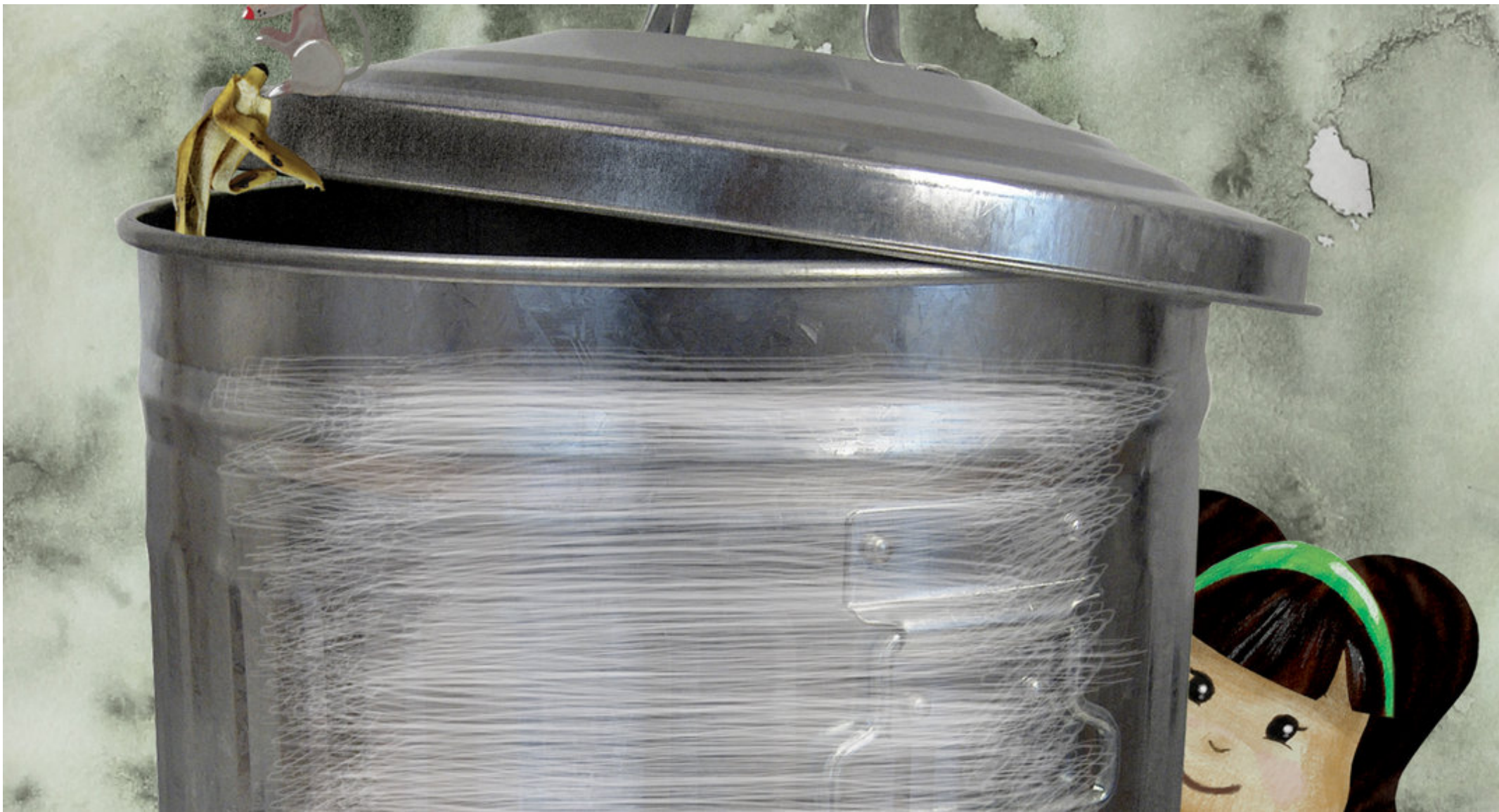
cubo de basura