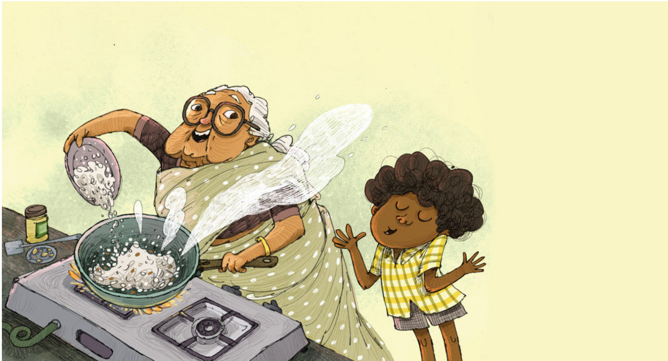
cocina de gas