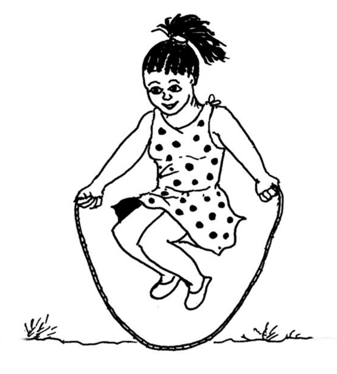
Puedo rebotar con el.