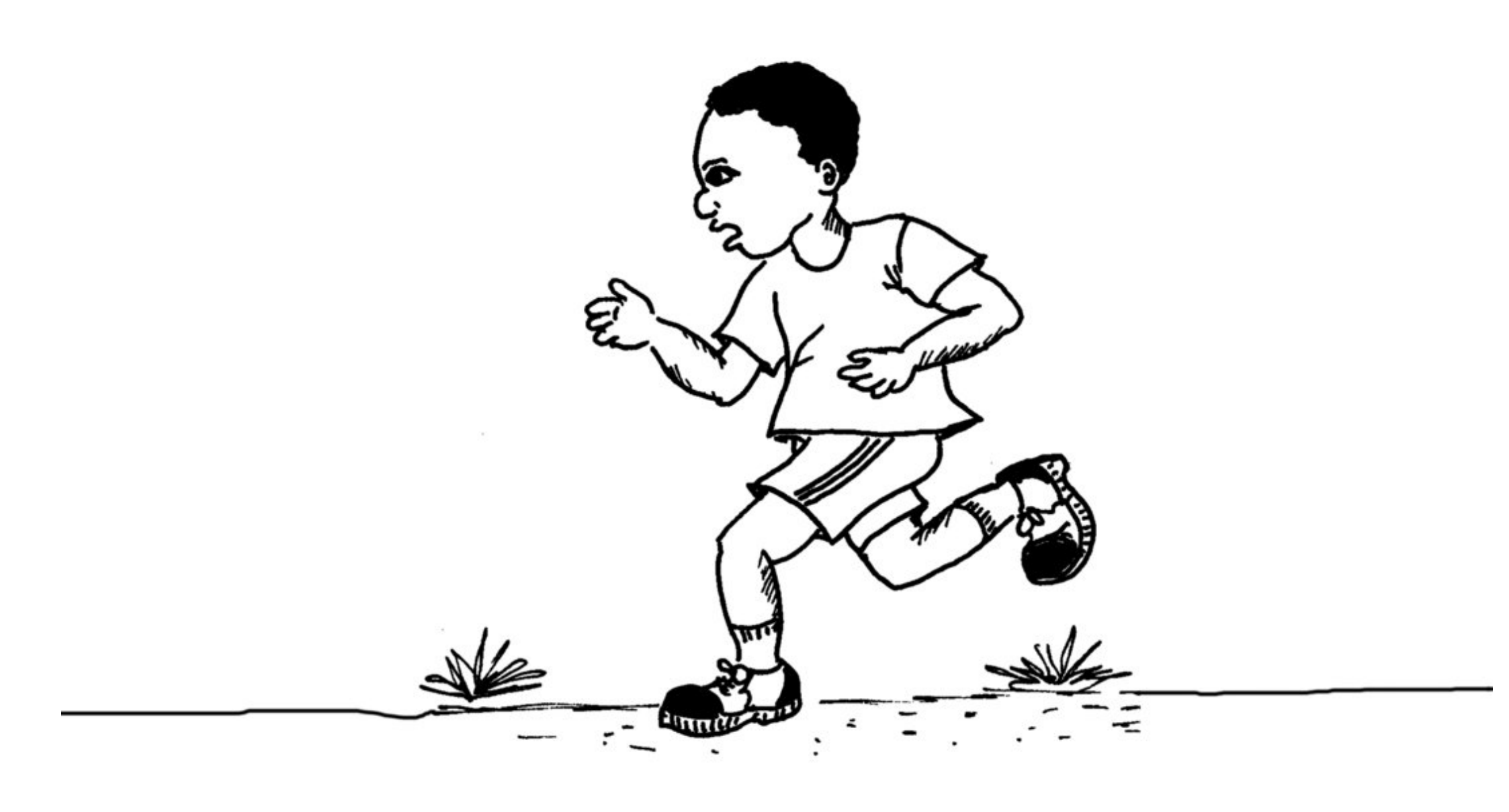
Puedo correr con el.