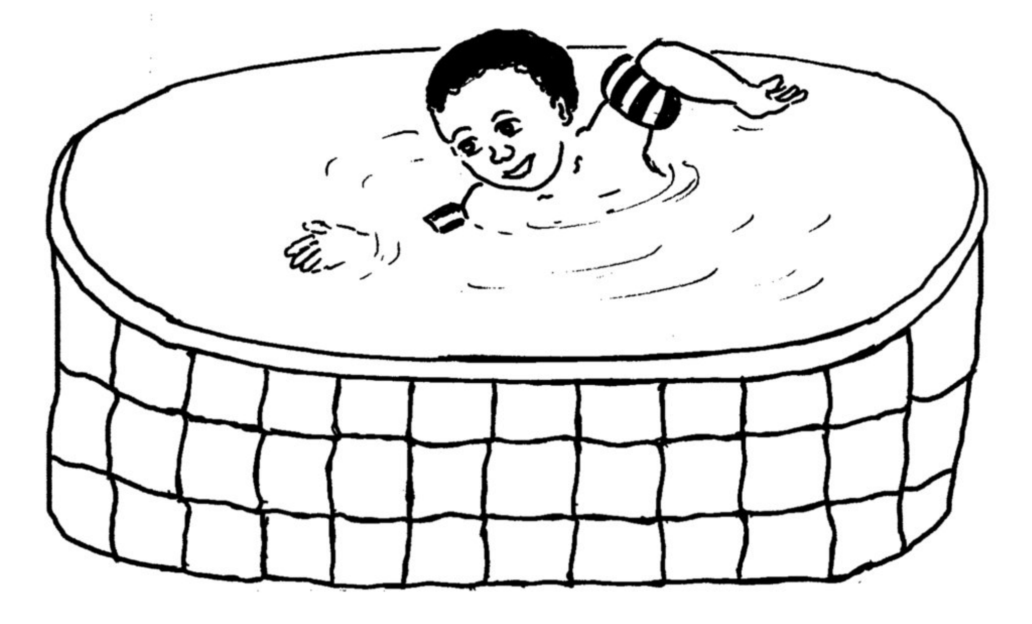
Puedo nadar con el.