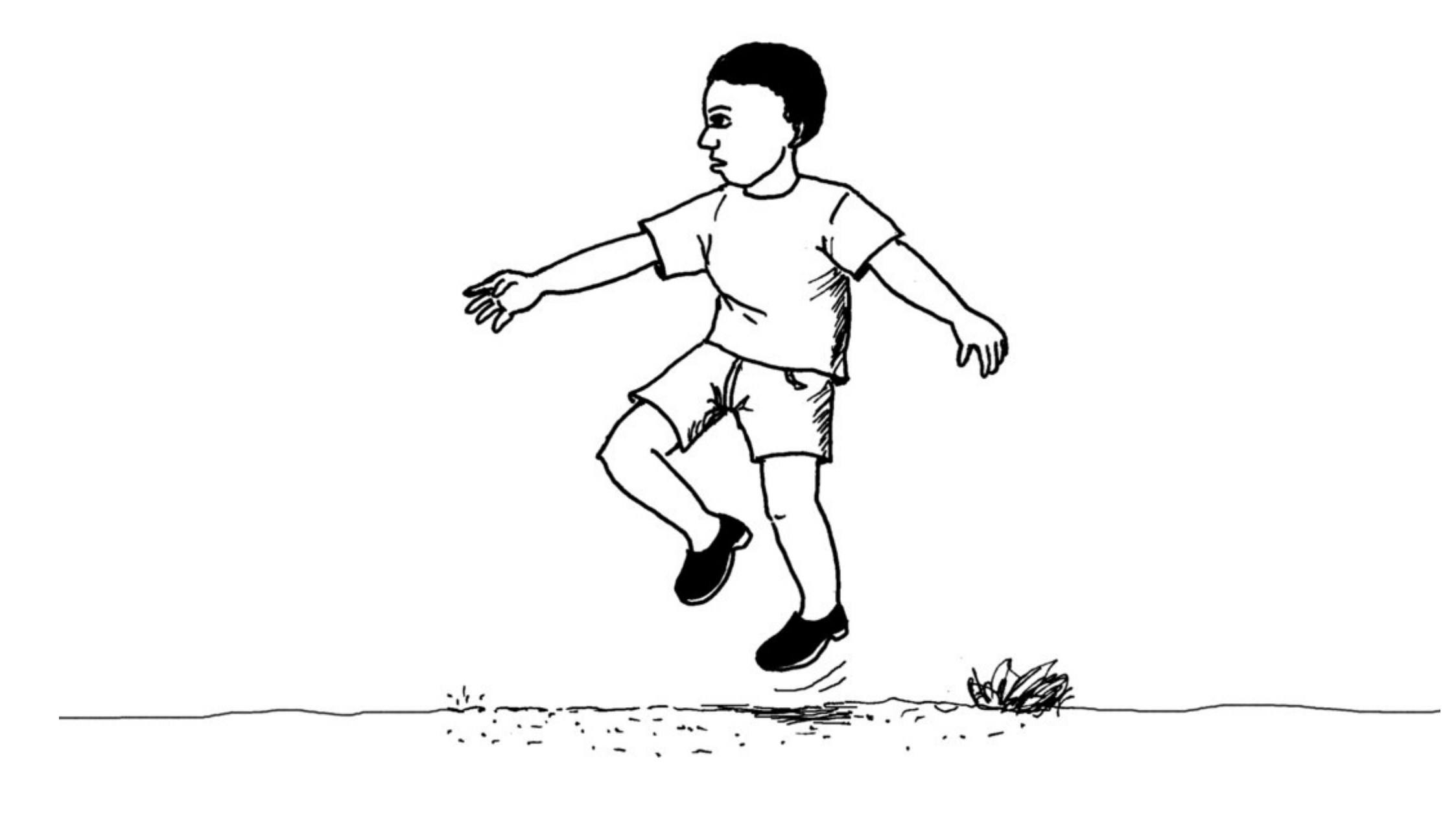
Puedo escapar con el.