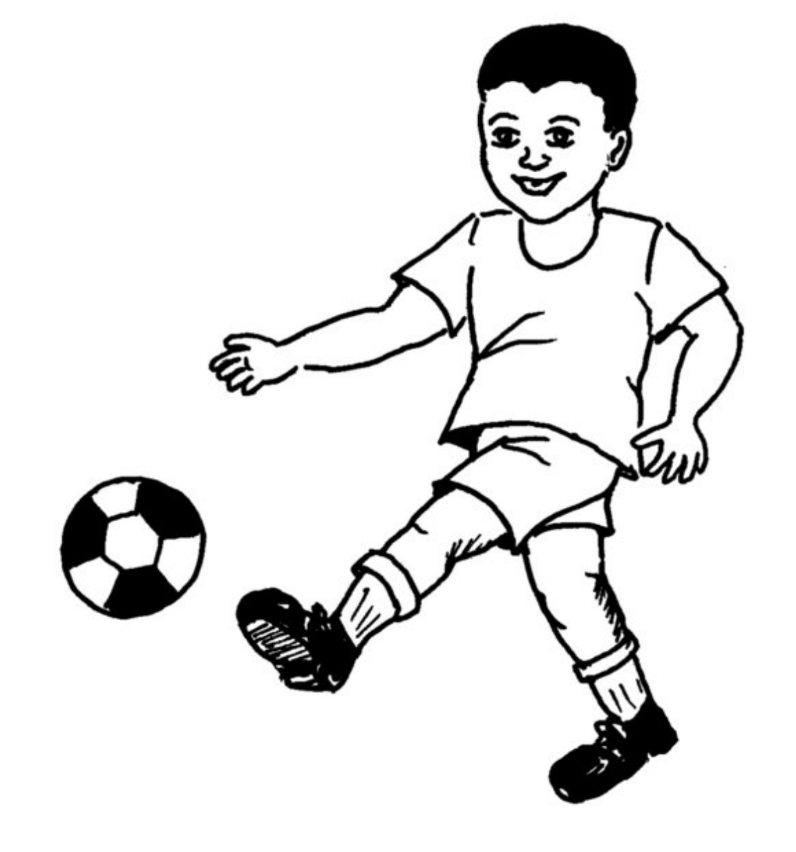
Puedo patear con el.