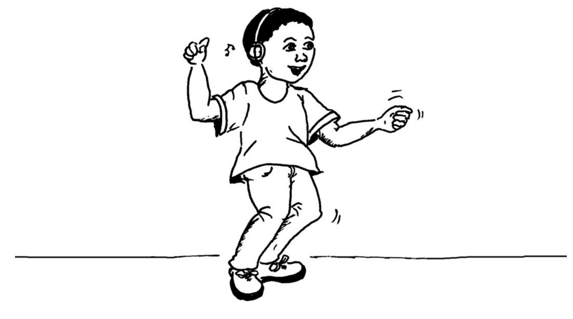
Puedo bailar con el.